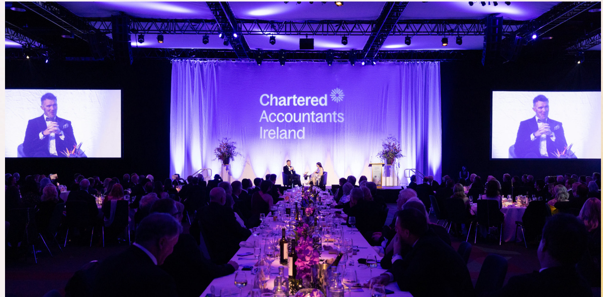
Chartered Accountants Ireland Annual Dinner 2026

Whether you're looking to engage, contribute, or grow, Chartered Accountants Ireland are here to support your ambitions. Partner with us today.